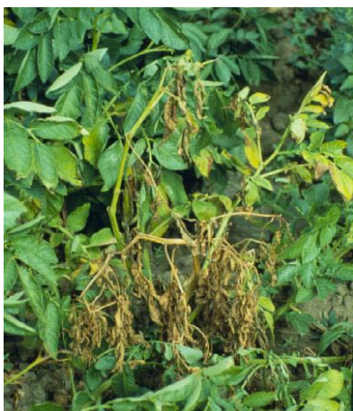
Complete and rapid foliar breakdown of potato plant due to late blight

applied at regular intervals when conditions favour disease development. The use of cultural practices, such as drip or furrow irrigation and the adjustment of plant stand density can be effective in reducing the risk or rate of disease development in alternative crops or smaller stands. Infected plant material should be disposed of as soon as possible after detection, either by burying or freezing. If infected crop debris is composted, it should be covered with a tarp or soil until it has frozen to minimize the risk of spore survival and distribution. Killing potato tops can help to minimize tuber infection, as this encourages tuber skin set and stops top growth. Tubers can be harvested a couple of weeks after the tops are killed. Tubers should be heavily graded and culled before storage in an attempt to prevent entry of the disease into storage.