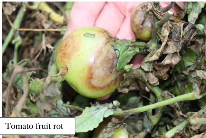
Tomato fruit rot