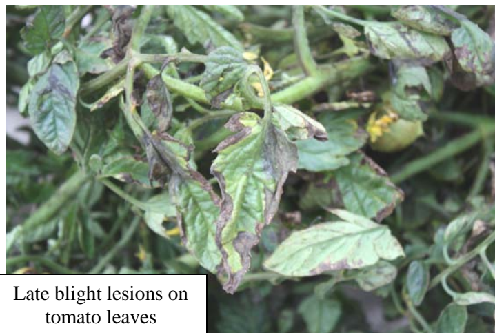
Late blight lesions on tomato leaves