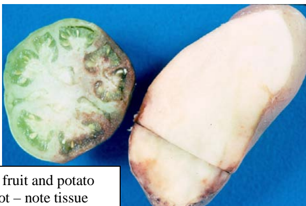
Tomato fruit and potato tuber rot – note tissue discoloration