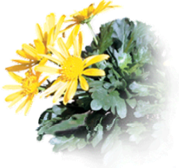
Marguerite Straelener Sunshine Early yellow blooms. Upright

Bright and popping with color, these daisy-like flowers are excellent in the garden and in containers.