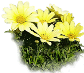
Marguerite Nelia Yellow Large sunny yellow flowers