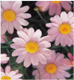
Pink Comet Large flower Upright, with green foliage