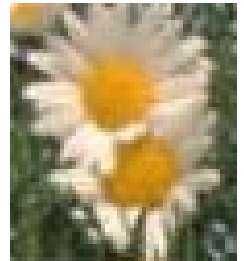
Silver Large flower Upright, with green foliage