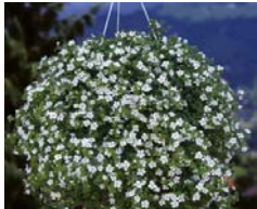
Falls Big White Trailing