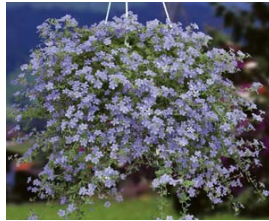
Taifun Blue Dream Upright, cascading