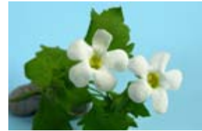
Taifun Mega White Upright, cascading