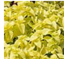
Wizard Sun Series Golden

Part-shade – bright red with yellow edge 45-55 cm/18-22" high