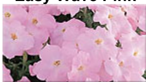
Easy Wave Shell Pink