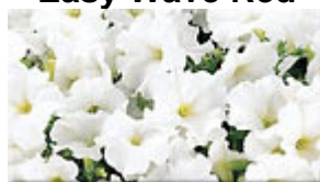
Easy Wave White