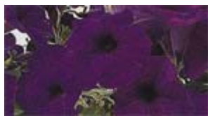
Easy Wave Blue

Easy to flower, high impact plants with minimal maintenance requirements. The easy choice all round!