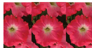
Easy Wave Rosy Dawn