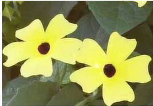
Yellow Dark Eye

So appealing with their twining heart-shaped leaves and brightly colored flowers, These vining plants look great alone or mixed in planters or growing up trellises and fences.